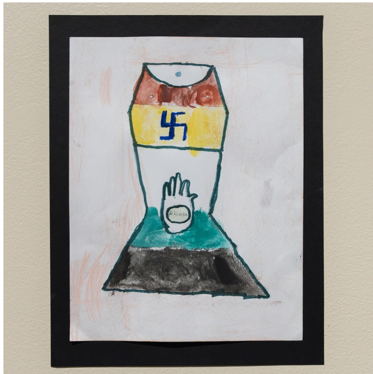
Prakriti Navaratan, "Jain Symbol," watercolor on paper