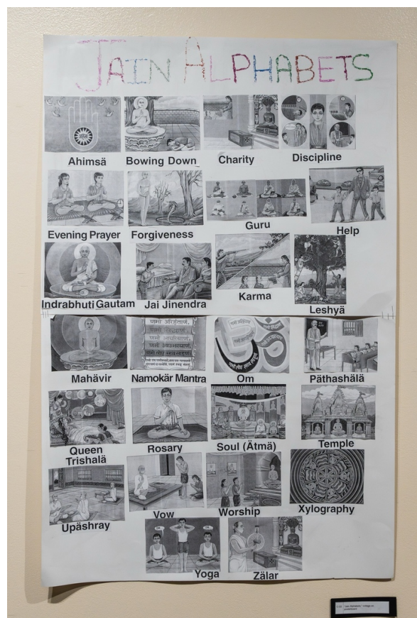
Mishita Jain, "Jain Alphabets," collage on posterboard