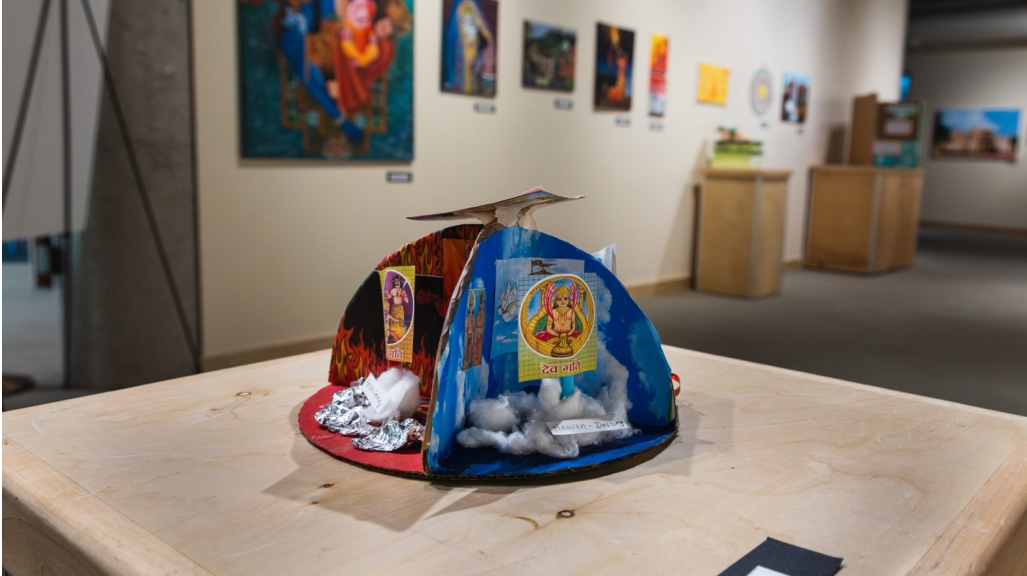
Dhriti Baldota, "Four State of Existence," 3D model