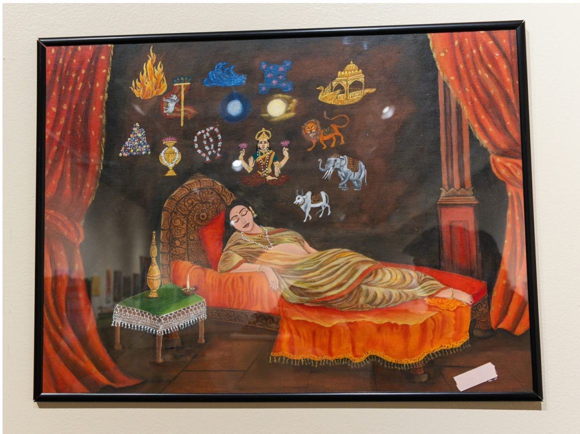
Tanya Sanghvi, "14 Dreams Seen by Mahavir's Mother Trishala," acrylic on canvas