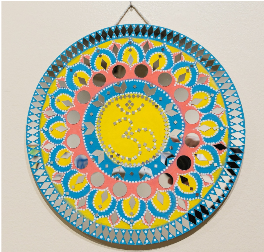
Rijul Gandhi, "Om," collage on board