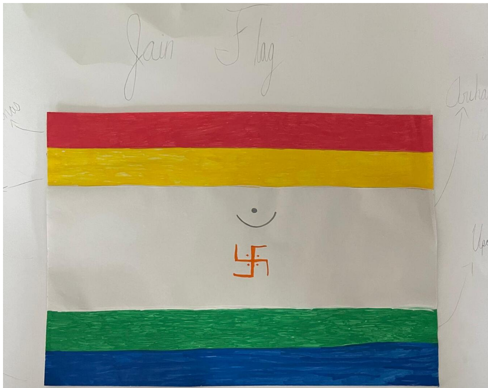
Divya Khara Patel, "Jain Flag," paper on posterboard