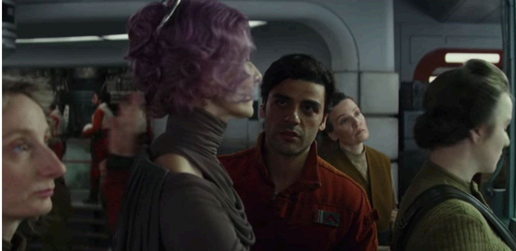
Figure 3. Screenshot from The Last Jedi with abundant female representation